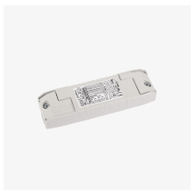
Driver ON-OFF EU 125-500mA 5,5-22W 220-240V Ref. 4.3069.1101