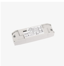
Driver DALI & PUSH EU 300-1050mA 3-38W 220-240V Ref. 4.3069.6101