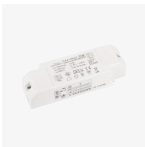
Driver ON-OFF 150-500mA 6,3-21W 240V Ref. 4.1069.1101